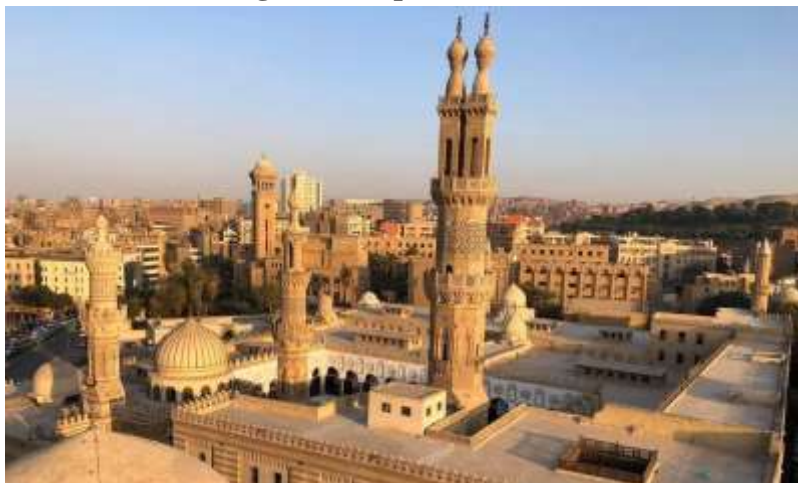
Figure 1.3. Amr Ibn Ash Mosque

This mosque was the first mosque built in Egypt and in Africa in 21 H/642M. at that time it was located in the city of Fusthat in the middle of Muslim housing. This mosque is used for worship and gathering to discuss world and religious affairs.