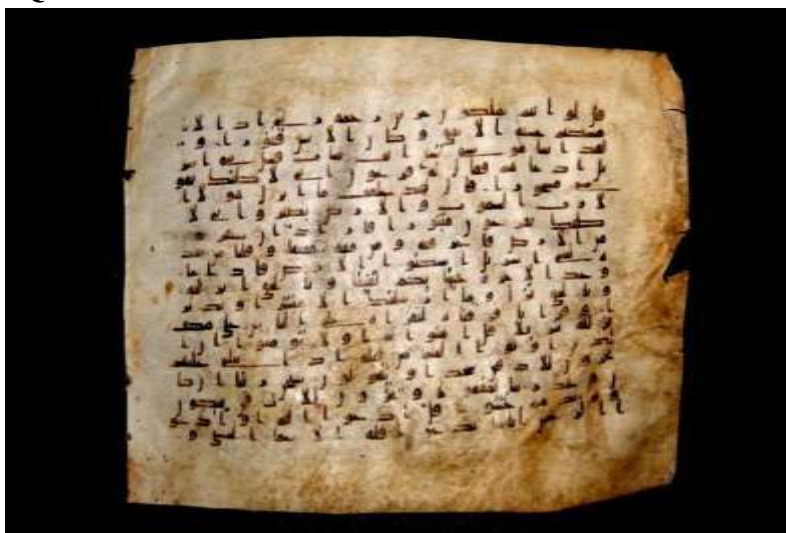
Figure 1.1. Bookkeeping of the Qur'an

The codification of the Qur'an was a hard effort by Caliph Abu Bakr As-Sidiq so that it can benefit until now. With this effort we can finally recognize the existence of the Qur'anic mushaf. Before the collection, the Qur'an was scattered in various places and written on various objects. Caliph Abu Bakr As-Sidiq made an effort to collect the revelation of God after getting advice from Umar bin Khattab, who at that time he was the main advisor to caliph Abu Bakr As-Sidiq.