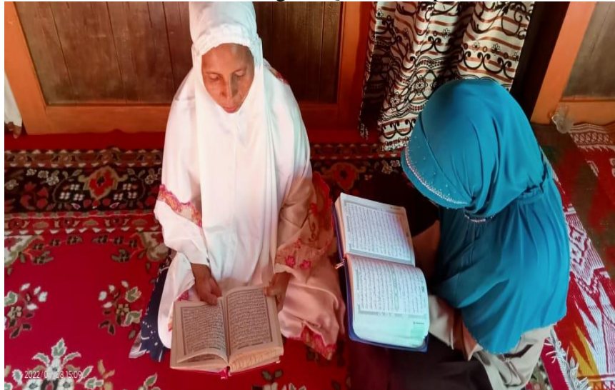
Future1. Reading Al-Quran with parents

Based on the research above, parents can teach their children to memorize the Al-Qur'an. Therefore parents provide a motivator in increasing interest in children in memorizing. Education in Indonesia is a field that has been dramatically affected by the Covid-19 pandemic. This is a complaint for students in learning limited by the government. Therefore teachers and students direct and create experiences that are detectable and challenging as well as inspired, creative, and innovative. During a pandemic, the teacher carried out an attitude assessment technique, a series of activities designed to measure students' attitudes due to a learning program. Education is the main