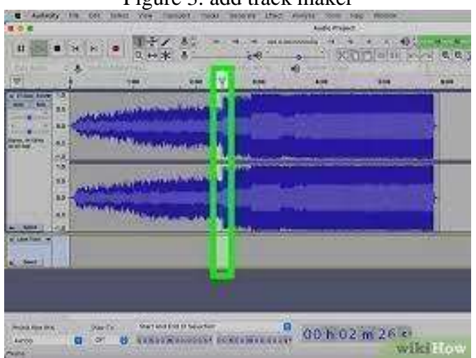
Figure 3. add track maker

In the creation of audio, the Audacity application is used to record and edit the recording results. First record the material to be inputted in the application after that clean the sound or eliminate the sound from noise, and then input the sound into the adobe flash LIBRARY CS6.n Audacity . The application of interactive learning of the human digestive system , the statement is based on the results of testing with a percentage of 37% who answered correctly increased to 96% and 63% who answered incorrectly decreased to 4%. This application is aimed at teachers in helping the delivery of Audacity material, the benefit is that students can more easily understand and understand the material of the human digestive system (Rafiq, 2010).